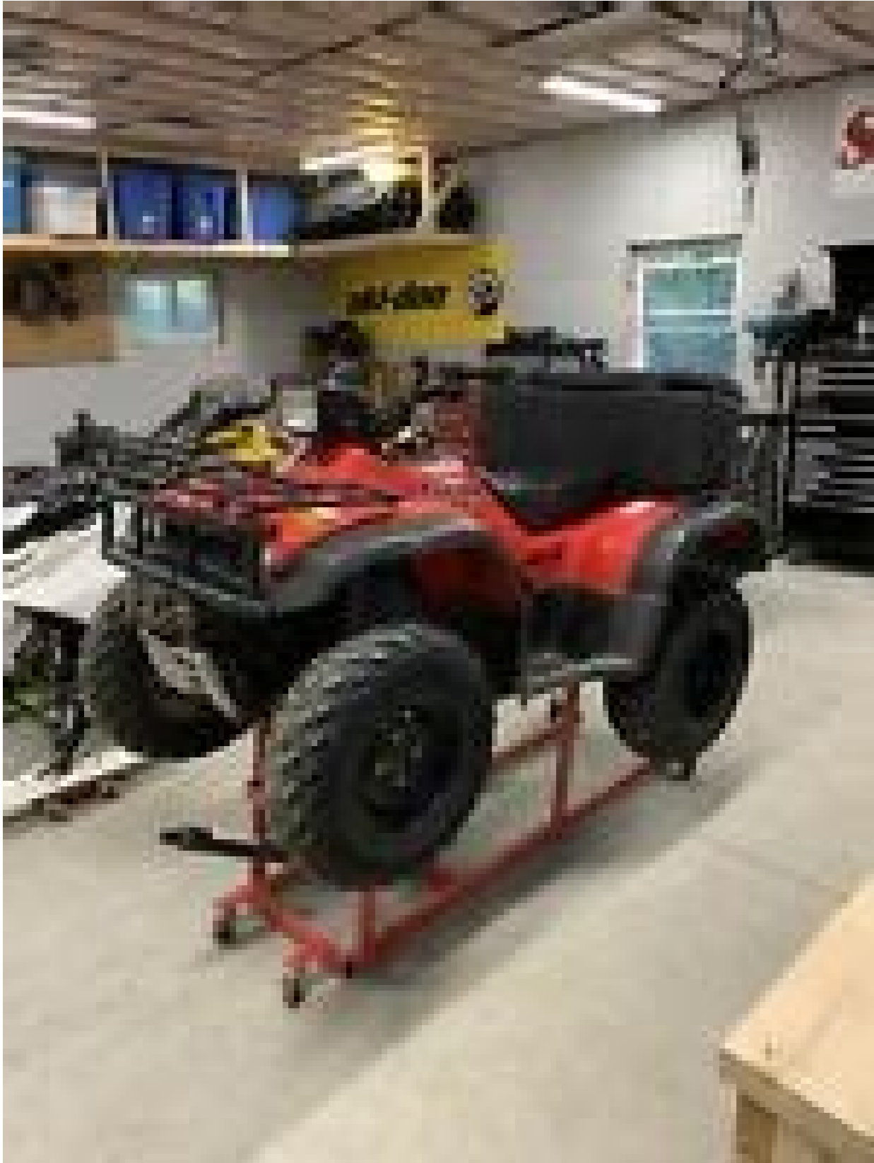
Honda foreman 450 for sale near me.